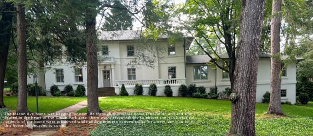
The Macon Ave home was begging for new life through this whole home renovation and addition. Seated in the heart of the Grove Park area, there was a responsibility to ensure the rich historical aspects of the home were preserved while adding modern conveniences for a new family to enjoy this home for decades to come.